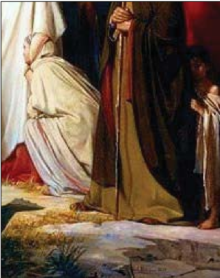
The painting on the sermon notes is entitled Jesus Raising Lazarus from the Dead by Carl H. Bloch, 1834-1890.