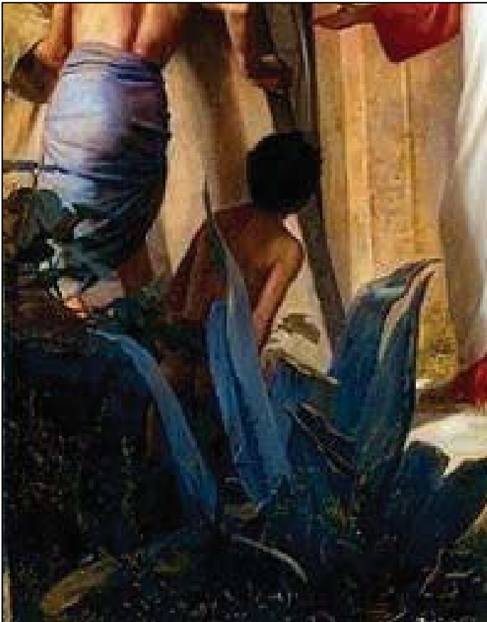
The painting on the sermon notes is entitled Jesus Raising Lazarus from the Dead by Carl H. Bloch, 1834-1890.