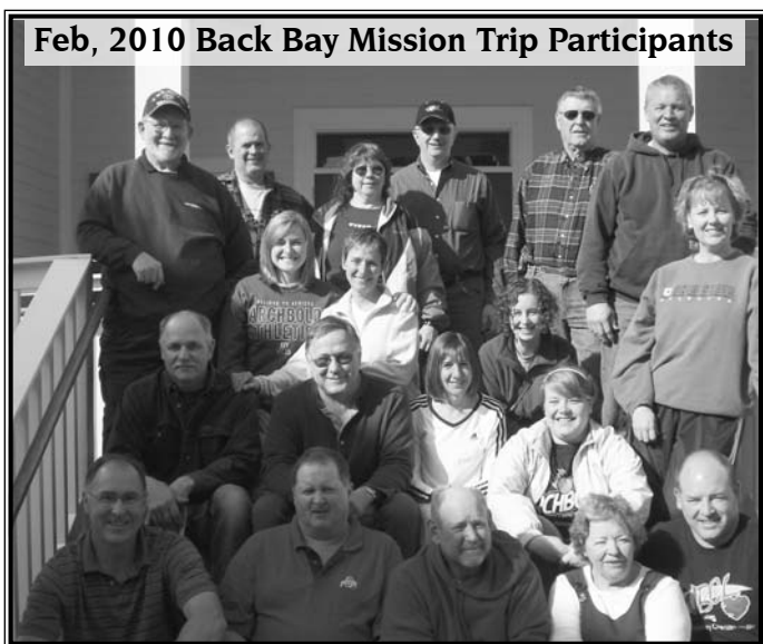
Feb, 2010 Back Bay Mission Trip Participants

St. John's will conduct another excursion to the gulf coast from October 16th to 23rd, 2010. The trip costs about $100 per person (for lodging, food and fuel) and only a willing heart and helping hands are necessary - no special skills or knowledge needed - just a desire to serve and share! Talk with one of the people pictured below about their past experience, and prayerfully consider sharing in this week long experience.