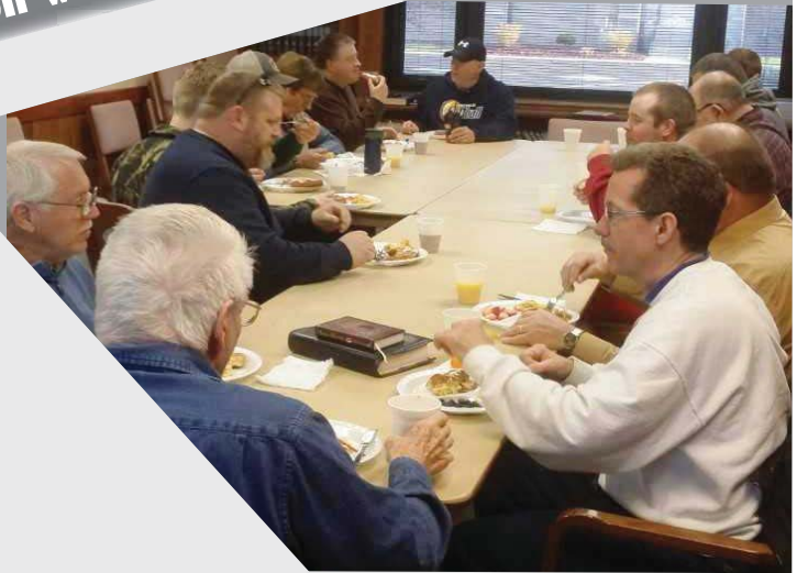
Men's Prayer Breakfast

Come Hear the Reason we're Inspired to Serve Together