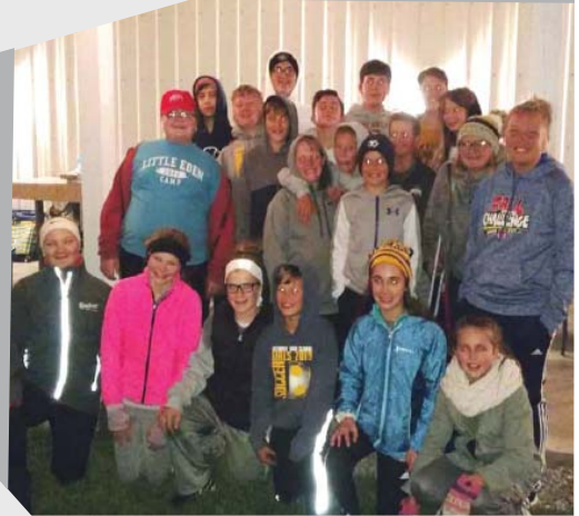
JYF Fall Outing

Come Hear the Reason we're Inspired to Serve Together