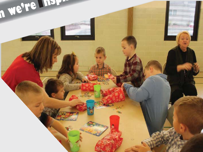
Birthday Party for Jesus

Come Hear the Reason we're Inspired to Serve Together