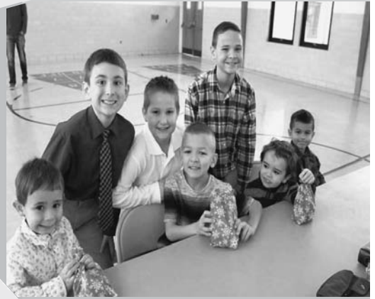
Birthday Party for Jesus

Come Hear the Reason we're Inspired to Serve Together