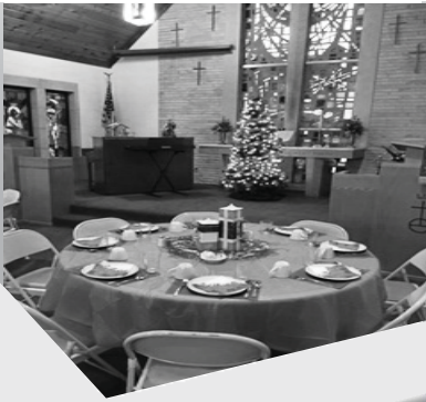
Senior Citizens Christmas Dinner

Come Hear the Reason we're Inspired to Serve Together