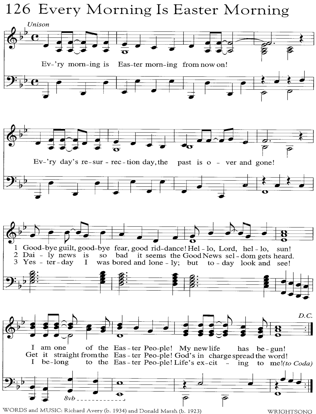
Words and Music © 1972 Hope Publishing Co.