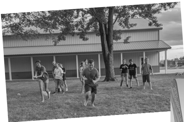
JYF and LOGOS had a blast with their evening activities in September!

It's hard to believe, but yes, we are thinking about Christmas! On Sunday, November 21st at 1:00 p.m. the church will be decorated for Advent and Christmas. It takes about 12 people to get down all of the decorations stored in the attic, prepare them for display, set-up the trees, hang or set out all of the many decorations, and then clean up afterwards. It's work, but it's also a time to fellowship with church family. We are relying upon people who have helped in the past, but we also need folks who have never done this before. Please consider and sign-up on the bulletin board!