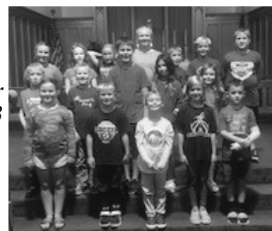
Logos Junior Choir rehearsal on 10/13

Couples Small Group began a marriage study titled, "Grace Filled Marriage" this past month. The next meeting is scheduled for December 12th at 6:00 p.m. in the Fireside Room. All are welcome! Please join us!