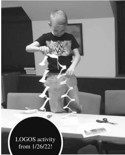
LOGOS activity from 1/26/22!

"The Church on the Corner Whose Cornerstone is Christ"