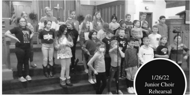
1/26/22 Junior Choir Rehearsal