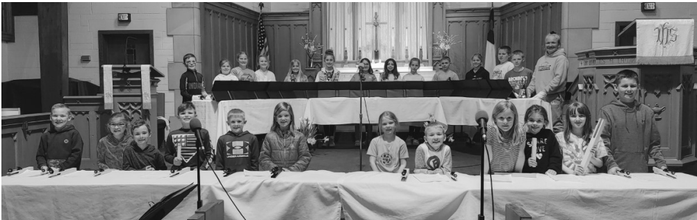
LOGOS Hand Bells and Chimes

Growing Hope Globally (GHG) was created to alleviate world hunger by globally connecting local communities through agriculture. The 2021 Soybean Project in which St. John's participated allowed GHG to send $12,869.57 from the year's successful growing season. 324 people were helped in finding lasting solutions to hunger. Donations given to Growing Hope Globally will provide for the ongoing blessing of the local project. Financial donations can be made through your weekly offering envelopes, or by selecting "Growing Hope Globally" as your designated fund in Breeze's online giving feature at stjohnsarchbold.org/online-giving/ .