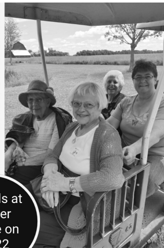
GIF Gals at Sauder Village on 6/9/22