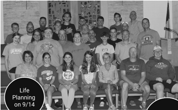
Life Planning on 9/14

"The Church on the Corner Whose Cornerstone is Christ"