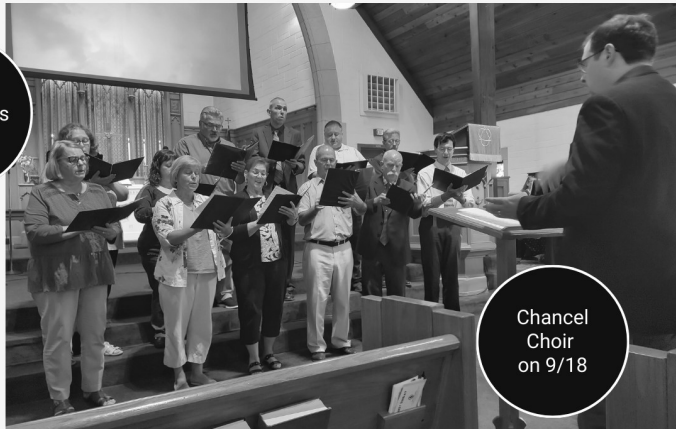
Chancel Choir on 9/18

C OME H EAR THE R EASON WE'RE I NSPIRED TO S ERVE T OGETHER