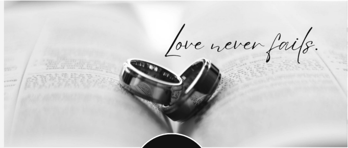
Curt & Kay Stamm