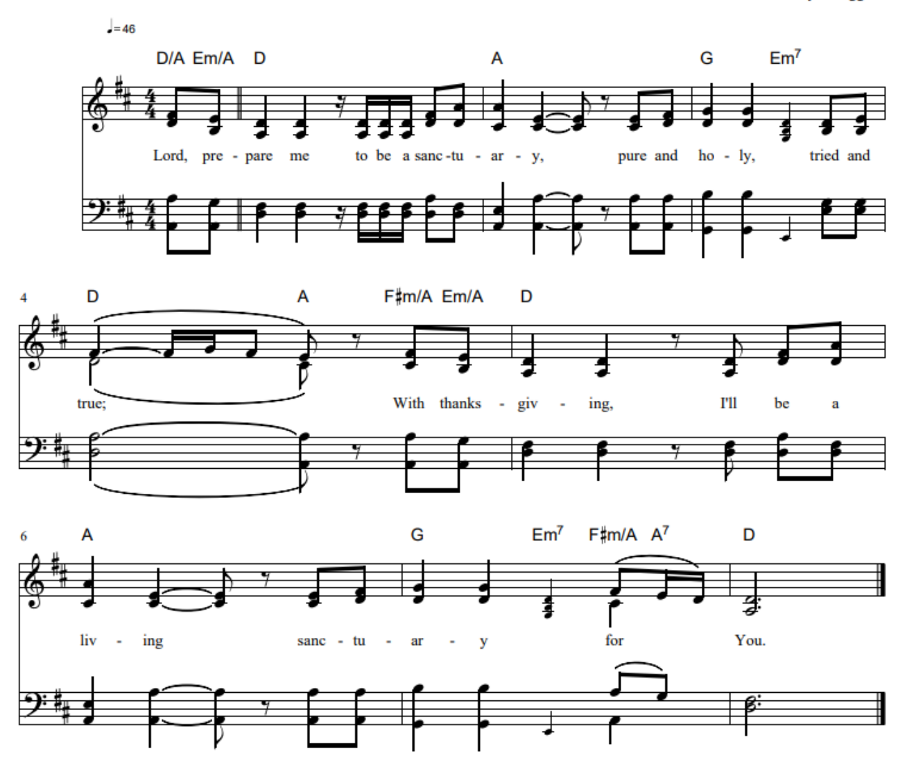
CCLI Song # 24140 © 1982 Full Armor Publishing Company | Whole Armor Publishing Company For use solely with the SongSelect® Terms of Use. All rights reserved. www.ccli.com CCLI License # 343326