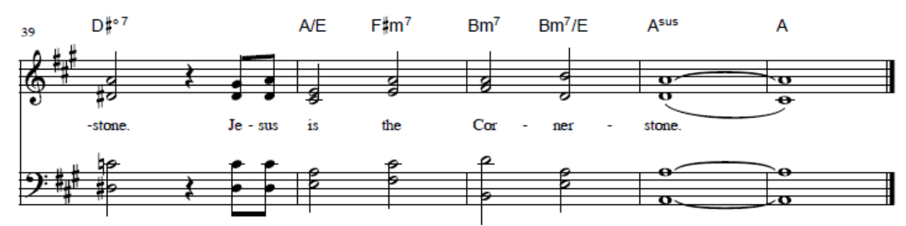
CCLI Song # 20838 © 1976 Bridge Building Music, Inc. For use solely with the SongSelect® Terms of Use. All rights reserved. www.ccli.com CCLI License # 343326