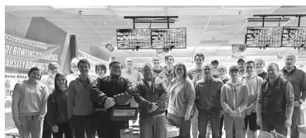
Life Planning bowling night on February 8th.