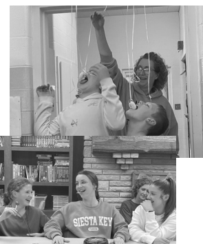
Fellowship Game Night on February 11th was a blast!