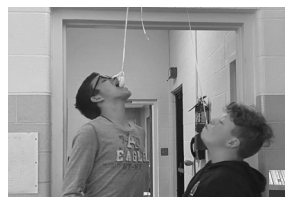
The JYF Advisors created yet another silly month of activities for our youth!