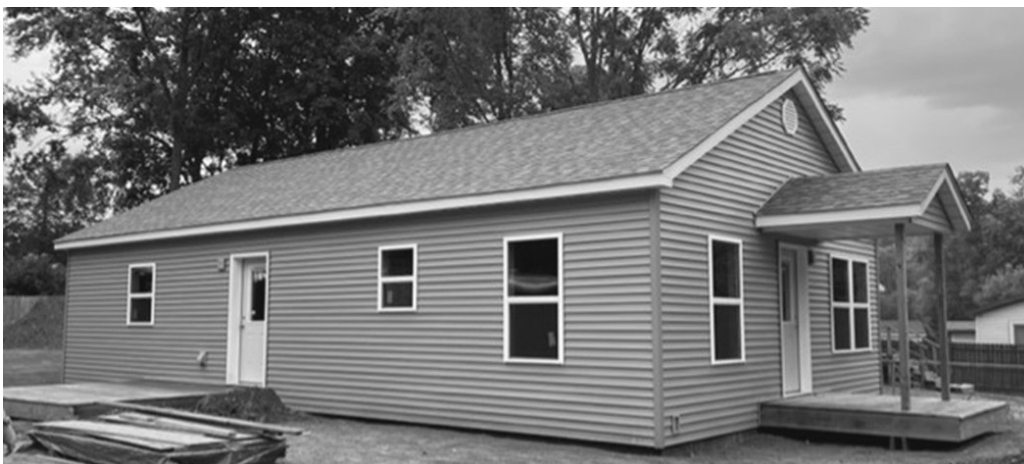
The 2022 Trip Volunteers installed windows, siding and porch decks to this home.

The plan is to drive up Monday morning to spend five days working on a new home build. The group will work until lunchtime on Friday and then return back to Archbold. Lodging will most likely be in one or two area Airbnb places (that worked well last year). The week has always turned out to be a very good week of work, fellowship and food! A sign-up sheet is posted on the bulletin board.